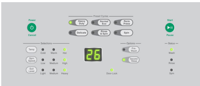
Electronic Homestyle Washer Control

Commercially built Speed Queen® washers and dryers are heavy duty and energy efficient. With a simplistic design and attractive styling, the easy-to-use commercial homestyle control panel features a variety of cycle and temperature settings to assure the best laundering possible.